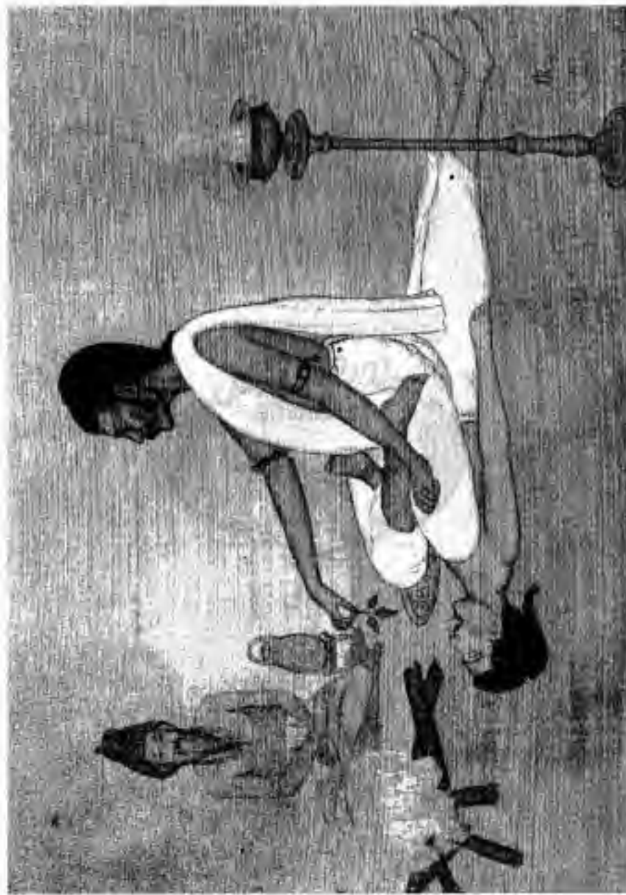
The dismissed minister sitting on the chest of his son's corpse.